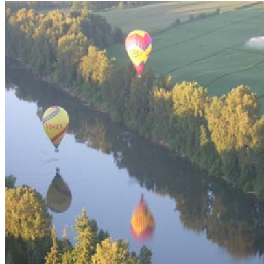
A Hot Air Balloon ride for Two People will be raffled off at this year's Awesome Autumn Auction.

Kids, and Literary—will be given away in a second raffle with ticket prices of $2.00 each or 3 tickets for $5.00.