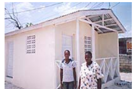
A Food for the Poor house in Haiti.

Saints' raised a total of $2,360.75 for Operation Starfish through Food for the Poor, Inc. This is enough to supply a simple house to a family in great need!